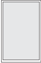
Full page 5"w x 8"h